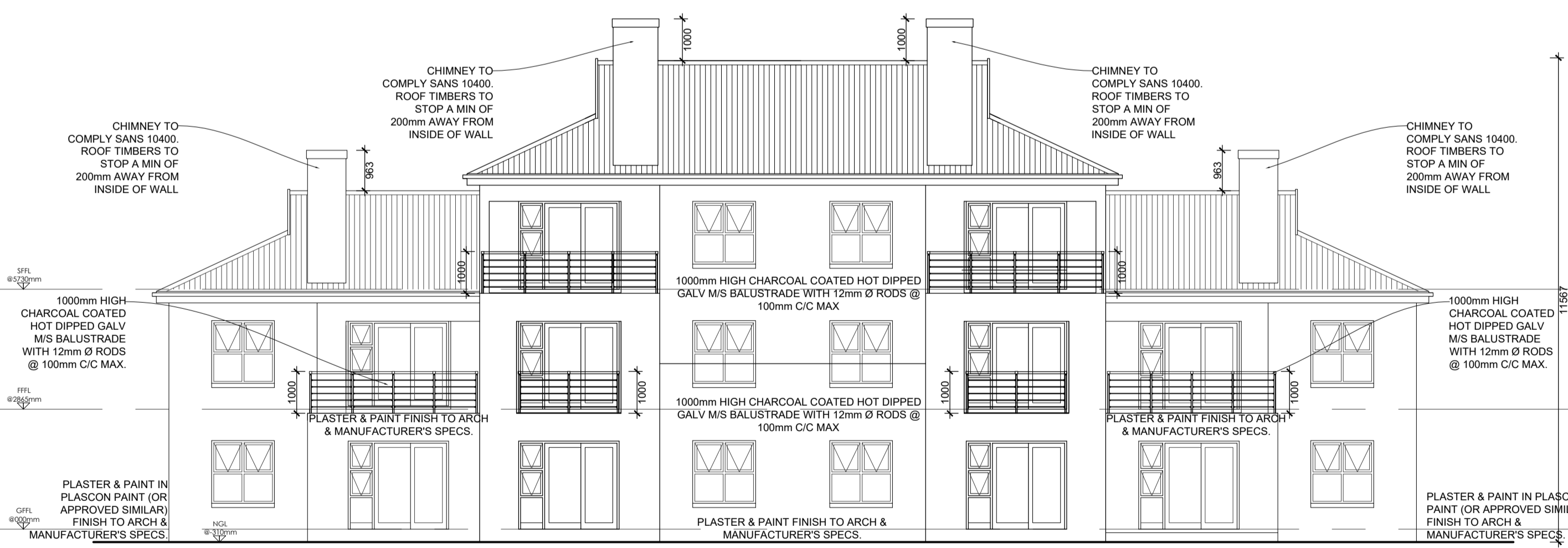
BLOCK 2 NORTH WEST ELEVATION SCALE 1:100